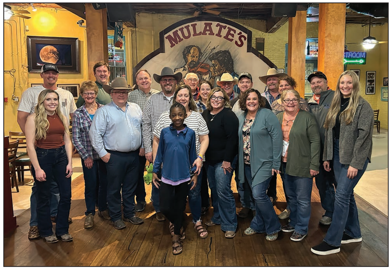
Minnesotans gathered to prepare for convention after arriving in New Orleans on Jan. 31.