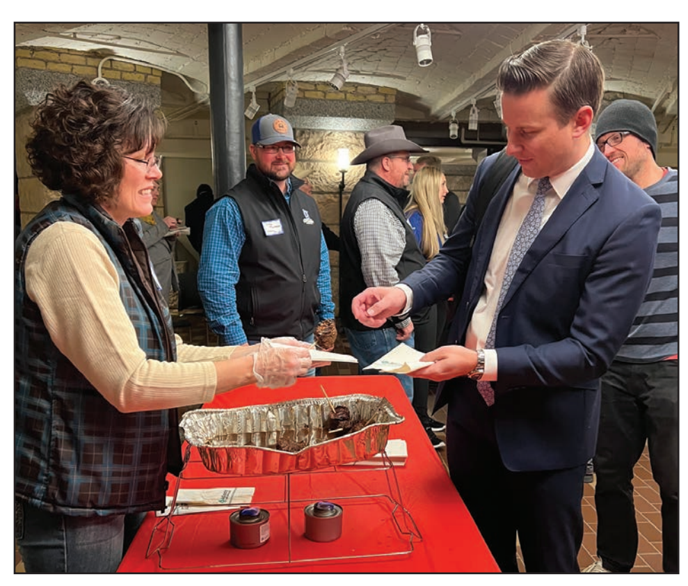
Due to the rainy day, steaks were served in the basement of the Capitol. The weather didn't stop Steak on a Stick from being another successful event!