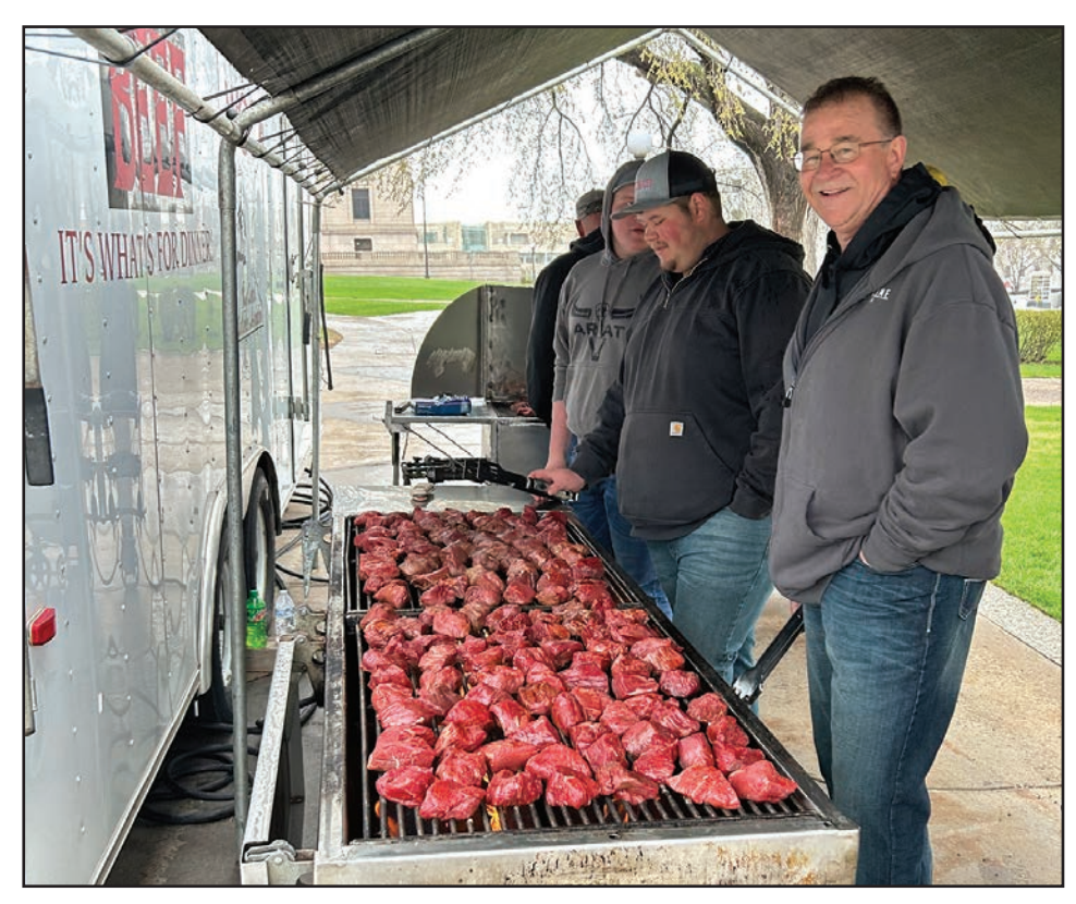
West Central Cattlemen's Association and Cottonwood Cattle Producers worked together to grill 750 steaks for Minnesota legislators and staff to enjoy.