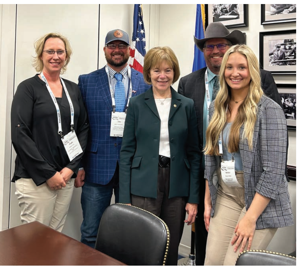
Senator Tina Smith (middle) pictured with MSCA team members.

CHECK US OUT ON THE WEB AT WWW.MNSCa.org