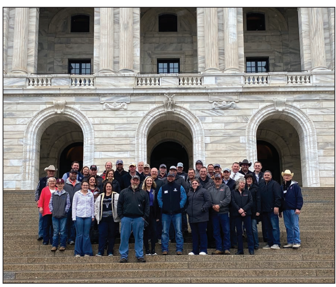
MSCA staff and members gathered together to grill steaks at Minnesota's Capitol on April 20.

The Minnesota State Cattlemen's Association (MSCA) hosted another successful Steak on a Stick event at Minnesota's Capitol on April 20. Thanks to the help of the West Central Cattlemen's Association and Cottonwood Cattle Producers grillers, we were able to serve 750 steaks to legislators and staff within one hour! The event was a huge success, and it offered the opportunity for MSCA staff and members to network with legislators and discuss policy. Huge thank you to everyone that came out to help with the event!